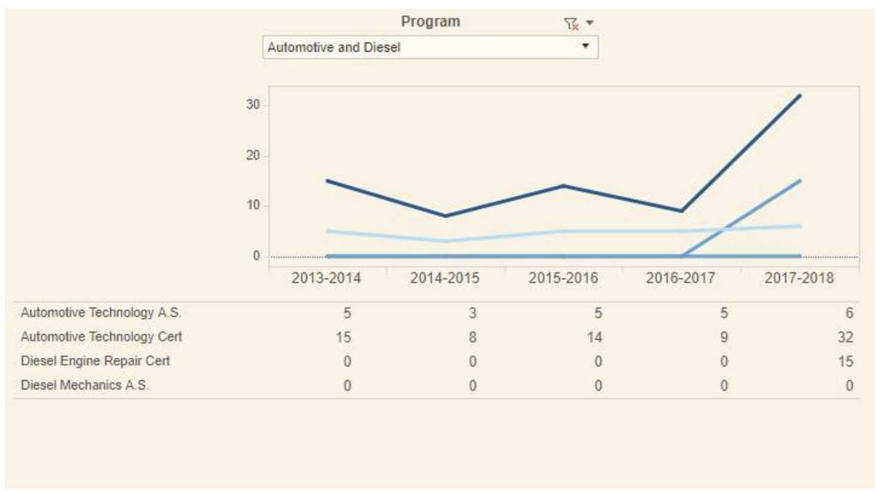
Certificates and Degrees awarded, Ventura College 18-19 AY Program Review Data

Course Success Rates, Ventura College 18-19 AY Program Review Data